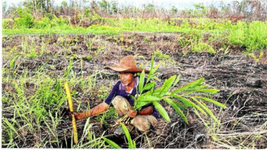
Nature under siege: A local farmer planting galangal in Rimbo Panjang, Indonesia. The ecological disaster has inflicted a staggering toll on the region's environment.

PARIS: The overlapping crises of climate change, mass species extinction, and an unsustainable global food system are on a collision course towards what might best be called an ecological land grab.