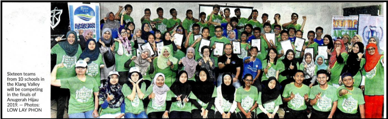
Sixteen teams from 10 schools in the Klang Valley will be competing in the finals of Anugerah Hijau 2019.