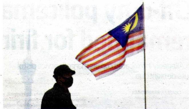
A man wears a mask during hazy conditions in Kuantan, Pahang yesterday.

He added that anyone convicted of open burning could be fined RM500,000 or face a jail term not exceeding five years, or both.