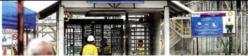
KAWASAN kilang pemprosesan nadir bumi Lynas di Kawasan Perindustrian Gebeng.