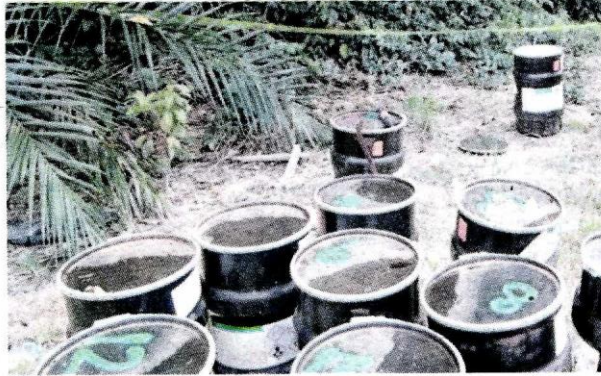
Polis tidak menolak kemungkinan tong yang mengandungi bahan sodium sianida dipercayai untuk dijual kepada pihak tertentu.

(sodium sianida) juga memakan kos yang tinggi dan ia perlu dilakukan di Bukit Pelanduk, Negeri Sembilan.