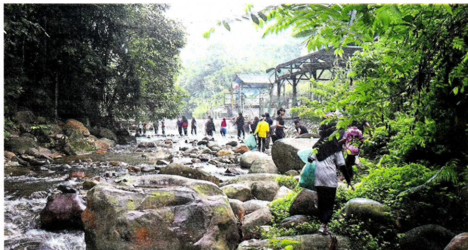
Anugerah Hijau participants picking up rubbish during the workshop in Gombak.

The finalists will be given until October to complete their projects before judging and the awards ceremony takes place. The finals will be held in conjunction with the Kuala Lumpur Eco Film Festival.