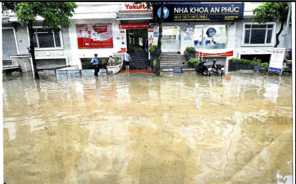
No way through: The path to a clinic submerged after Tropical Storm Wipha struck in Hanoi.

Vietnam is among the most vulnerable nations to climate change