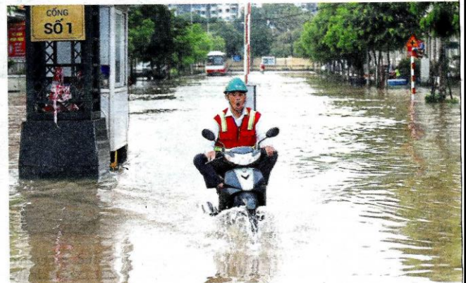
Ankle-deep: A man riding his motorcycle through a flooded road after the storm. — Reuters

Landslides in the southwestern province of Sichuan also left one person dead and at least 11 missing on Thursday, according to state broadcaster CCTV. — dpa