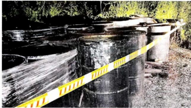
Sebanyak 112 tong berisi minyak bitumen itu dijumpai diletakkan di tepi jalan berhampiran pembentungan sungai di Kampung Sungai Jang, Kerling.

Beliau turut memberitahu, siasatan lanjut turut mendapati tong-tong ter-