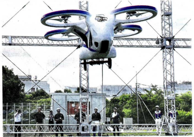
Big ambition: The flying car hovering at NEC's facility in Tokyo. Japan is seeking to become a leader in flying cars after missing out on advancements in technology such as electric cars and ride-hailing services, — AP

Eventually, NEC's flying car will be set free: Cartivator has been granted a permit for outdoor flights by Japanese government. — Bloomberg