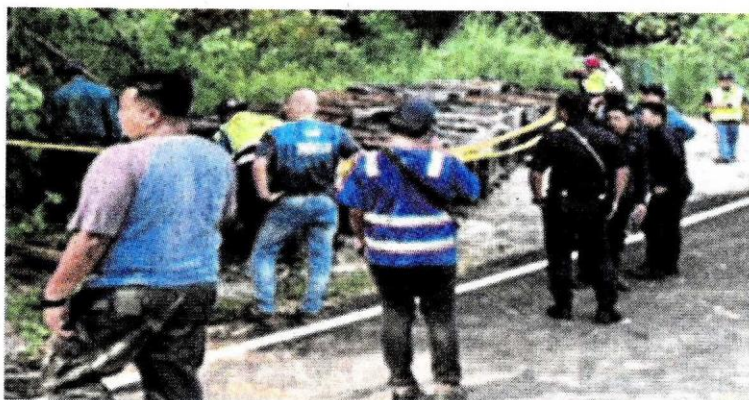
Pihak LUAS memasang pita sekatan di lokasi 112 tong berisi cecair mudah terbakar ditemui berhampiran anak sungai di kampung Orang Asli Sungai Jang, Kerling, Hulu Selangor, semalam.

"Susulan laporan ini, satu operasi bersepadu dijalankan LUAS, MDHS, Jabatan Alam Sekitar (JAS) Selangor, Polis Diraja Malaysia (PDRM), Pengurusan Air