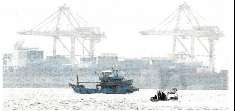
Pemandangan Pelabuhan Pulau Pinang kabur dipercayai akibat jerebu.

"Peta Jerebu Serantau dikeluarkan ASMC menunjukkan terdapat lingkaran asap jerebu dari kawasan kebakaran tanah dan hu-