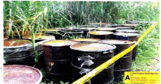
TONG disyaki berisi minyak bitumen ditemui di anak sungai berdekatan perkampungan Orang Asli Sungai Jang, Kerling, Hulu Selangor pada Sabtu lalu.

“Selain itu, JAS turut telah mengarahkan pemilik kilang berkenaan untuk menguruskan kesemua tong itu dengan menjauhkannya dari sungai seperti yang tertakluk di bawah Akta