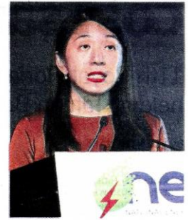
Yeo hopes to see the NEA evolve to be the leading platform for the sustainable energy industry.

She added that Malaysia would take part in the Expo 2020 Dubai in October, with GreenTech Malaysia as the implementing agency for the Malaysian Pavilion. The pavilion is intended to target RM10bil in